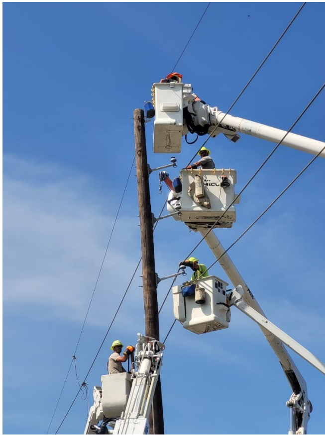
Alliant Lineman work to restore power following Hurricane Ida in Louisiana.